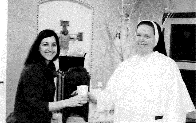
Home & School Coffee Cart for Teacher Appreciation.