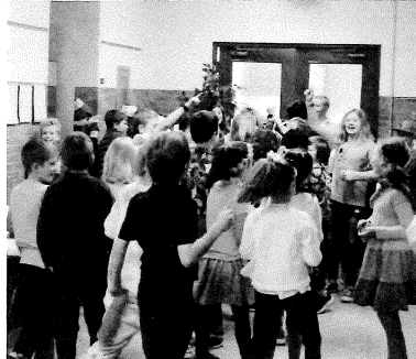
Students enjoy the Coin Crusades!

Thank you to all of the faculty, parents, volunteers and students for making this year's Catholic Schools Week such a success!